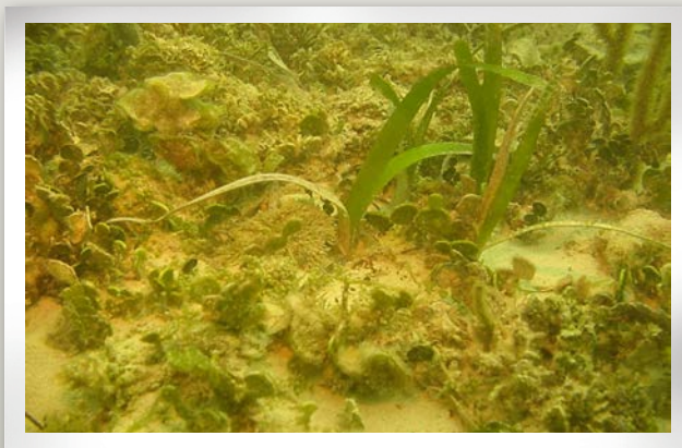
Green macroalgae growing near turtle grass shoots.

seagrass-dependent species are likely to disappear due to lack of habitat. Instead, animals that feed and live in the water column as part of the microalgae-based food web will predominate. This shift from a seagrass-based food web to one that is water column-based represents a significant change in the area's ecology and can negatively affect recreational and commercial fisheries, which depend upon seagrass meadows as nurseries and feeding grounds.