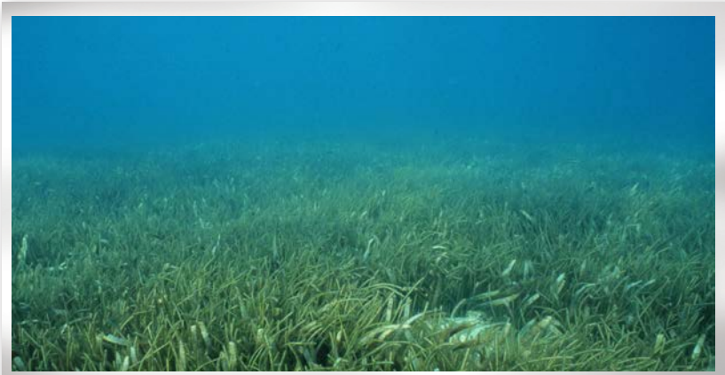
Grassbed with turtle grass (wide blade) and manatee grass.

Protection Agency and the state of Florida, was established to protect the coral reef from impacts due to nutrient pollution. Since its inception, the program has supported critical ecosystem monitoring and research projects designed to help sanctuary managers make informed decisions about resource issues.