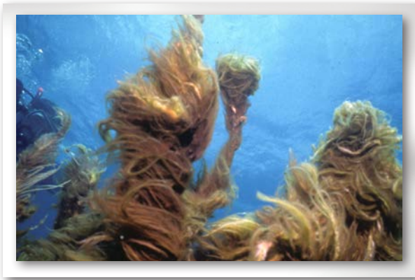
Nutrient enrichment promotes macroalgae growth.

Stormwater is a major source of pollutants in the Keys. Washed from the land into nearshore waters, stormwater introduces organic debris, silt, nutrients, metals and oils, and sometimes pesticides, herbicides and fertilizers. Hard, non-porous surfaces like roads, bridges and most parking lots contribute to stormwater runoff, but significant runoff also occurs from yards and other landscaped areas.