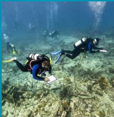
SCIENCE & RESOURCE PROTECTION