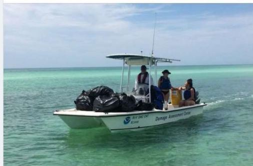
Image description: People on a center console boat with several full trash bags on the deck.

Visit http://go.usa.gov/x7WQd to learn more!