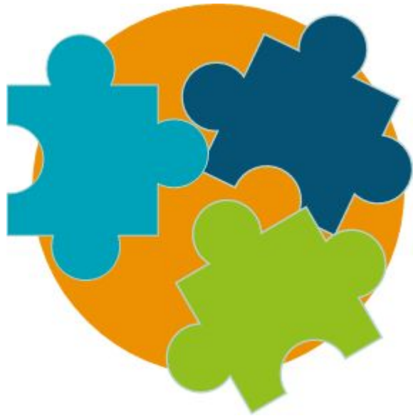
Roles and Responsibilities