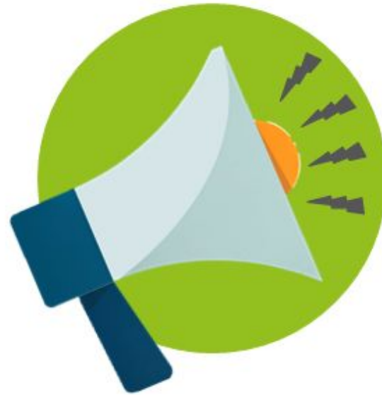
Recommendations and External Communications